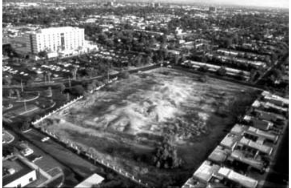
Mesa Grande, seen from the air, is about to be transformed.

At this point we are also exploring the possibility of building a small structure near the entrance to the site on 10th Street. This structure would contain a small