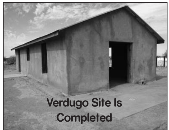
Verdugo Site Is Completed