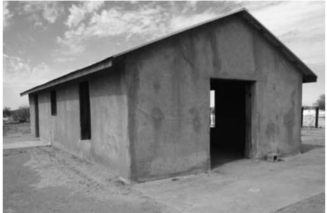
Window screens will complete the renovation of the Verdugo schoolhouse.

But we're not done yet. We plan to put window screen in the schoolhouse windows. It is hoped that the screens will cause the rain to flow down the outside of the building and avoid damaging the interior mud plaster.